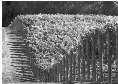
The contours of Lindsay Vineyard provide a dynamic environment for pinot noir

At the time of the Open House, this wine was already showing impressive body, concentration