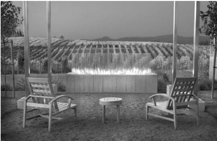
View of Lindsay Estate Vineyard from our guest lounge.

PAUL HOBBS WINERY & VINEYARD 3355 GRAVENSTEIN HIGHWAY NORTH SEBASTOPOL, CALIFORNIA 95472 WWW.PAULHOBBS.COM