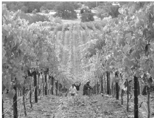
Kick Ranch Vineyard flanks Spring Mountain to the West Harvest looking downhill