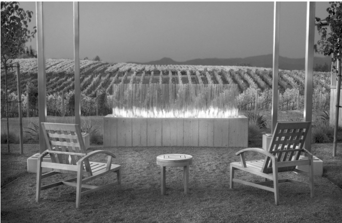
View of Lindsay Estate Vineyard from our guest lounge

WWW.PAULHOBBS.COM SEBASTOPOL, CALIFORNIA 95472 3355 GRAVENSTEIN HIGHWAY NORTH WINERY & VINEYARD PAUL HOBBS