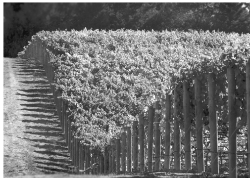
The contours of Lindsay Vineyard provide a dynamic environment for pinot noir

At the time of the Open House, this wine was already showing impressive body, concentration