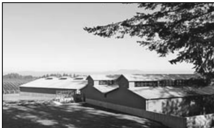
Our new hospitality center will overlook our winery and vineyard

In May the Supreme Court ruled in favor of wineries and wine-lovers, deciding that states currently allowing in-state winery