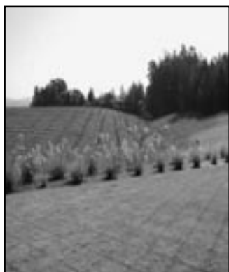
Lindsay Vineyard in spring before budbreak