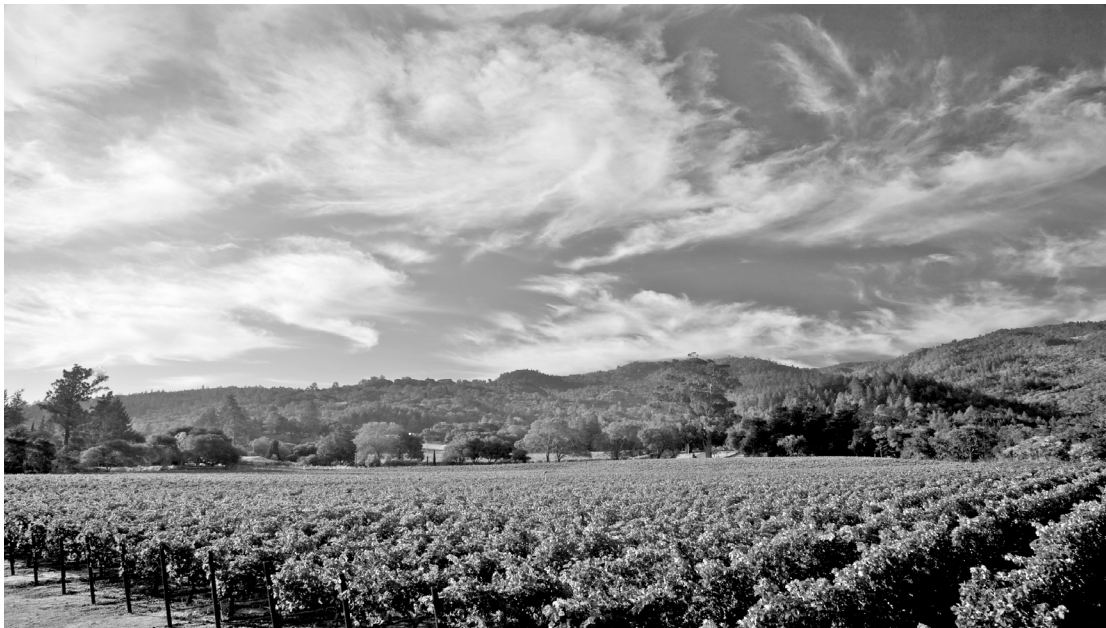
A sweeping view of Beckstoffer Las Piedras Vineyard in Napa, the site for our new vineyard designate cabernet sauvignon.